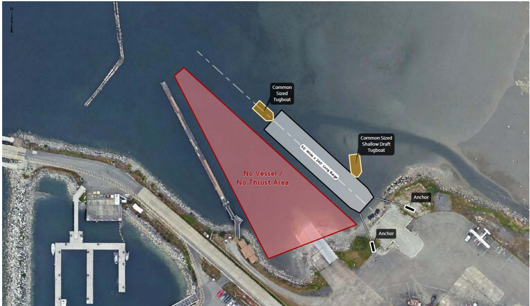
Barging Operations Tugboat Arrangements (common size)