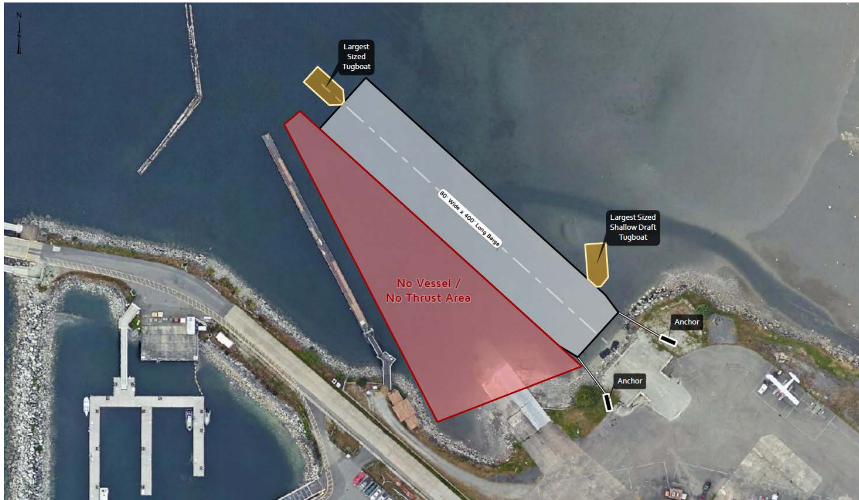
Barging Operations Tugboat Arrangements (largest size)